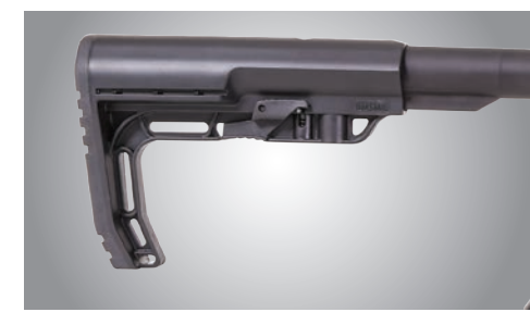
Six-way Ultra Light Adjustable Stock