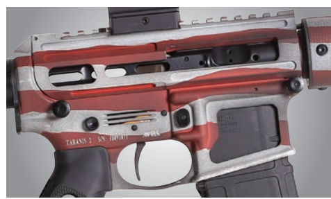
Ultra Light, Skeletonized, Forged Machined Receivers