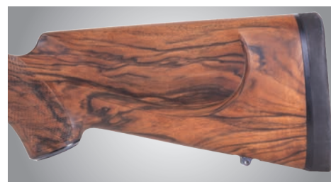
Hand Rubbed Satin Oil Finish