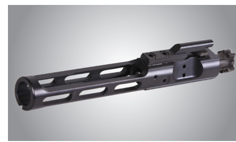
Skeletonized Bolt and Bolt Carrier