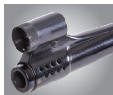
Super Eliminator™ Muzzle Brake