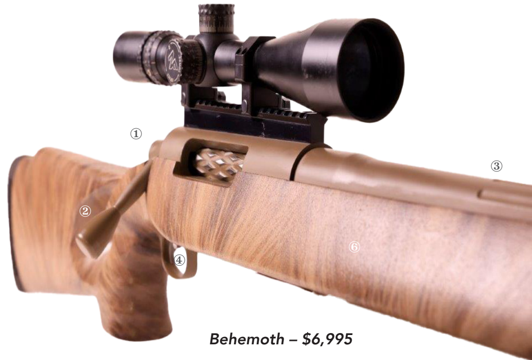
Behemoth – $6,995