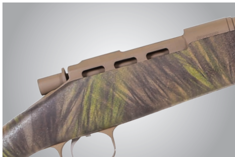
Action – Lightened & Skeletonized