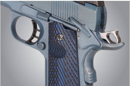
High Ride Beaver Tail Ambidextrous Safety