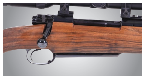
Unequalled Stiller Action

Turkish Walnut with Exhibition Gloss Blue Finish