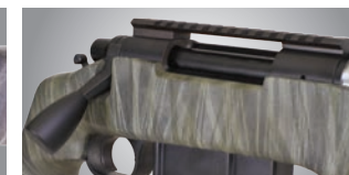
Blueprinted Remington® Action