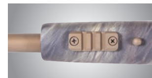
Option Picatinny Rail for Atlas Bipod