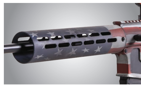
Carbon Fiber Hand Guard