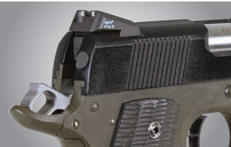
Night or Fixed Sights