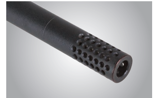
Super Eliminator™ Muzzle Brake