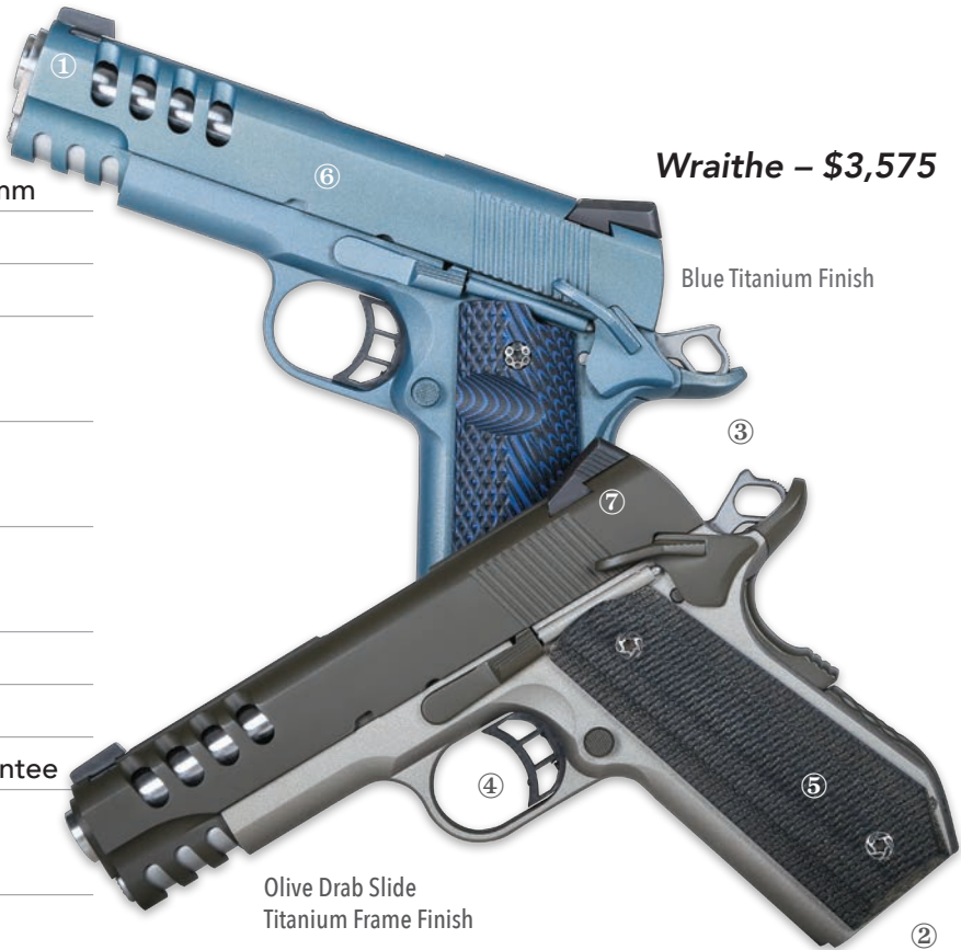
Wraith – $3,575