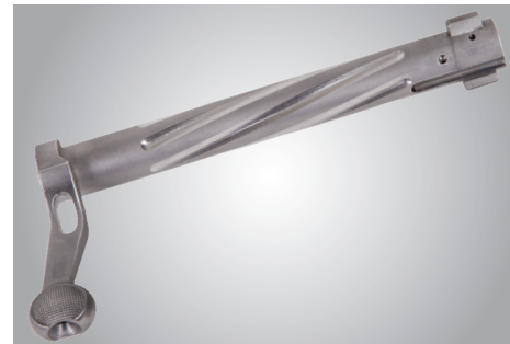
Bolt Fluted & Skeletonized