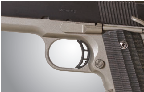
3 1/2 lb. Lightweight Trigger