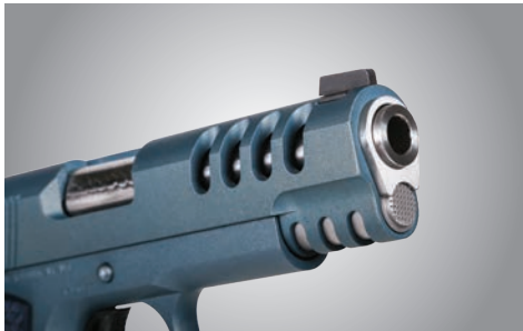
Skeletonized Barrel Chamber